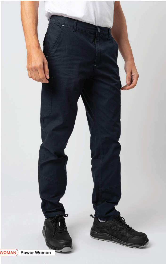
WOMAN Power Women